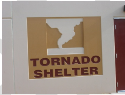
Suitable Living Environments