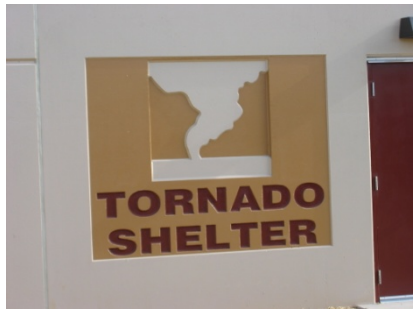
Suitable Living Environments