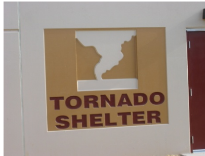
Suitable Living Environments